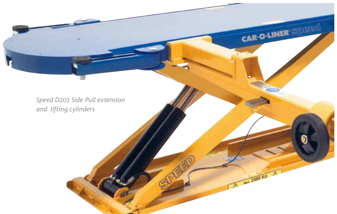
Speed D201 Side Pull extension and lifting cylinders