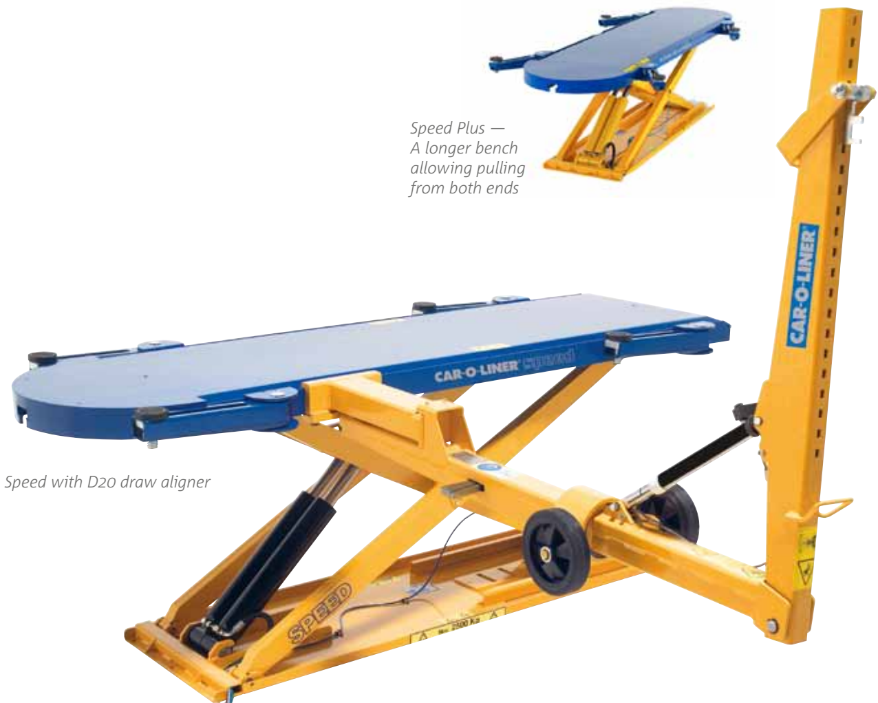
Speed Plus — A longer bench allowing pulling from both ends