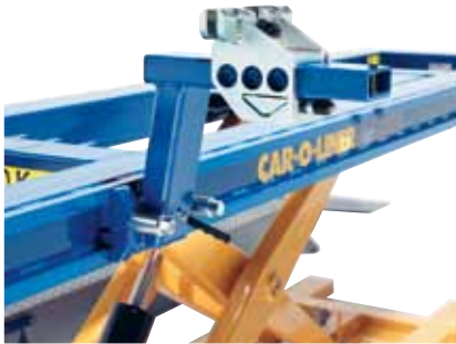
Optional chassis clamp (B110) offers faster setup and removal using just two bolts.