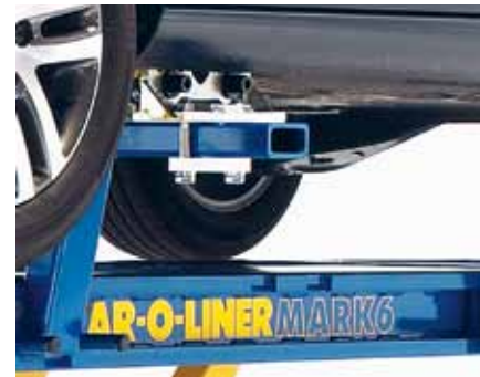
Longer bench arms allow maximum work space between bench and underside of vehicle.