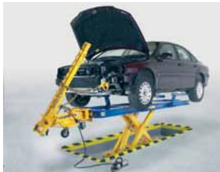
In-ground installation leaves frame level with floor allowing for easy drive-over and clean shop appearance.