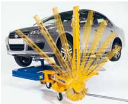
Powerful 10-ton Draw-Aligners pull from almost any angle, 360° around the vehicle.