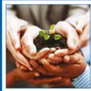
Willingness to change